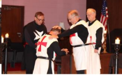
Palestine # 20, Public Knighting Ceremony