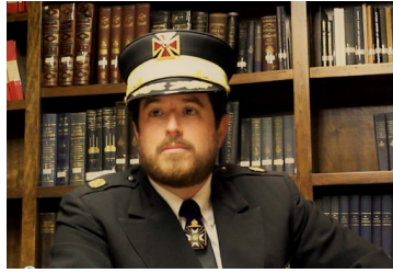
Eminent Deputy Grand Commander