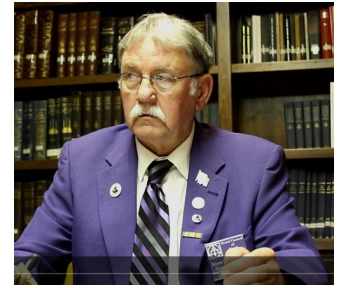
Most Illustrious Master